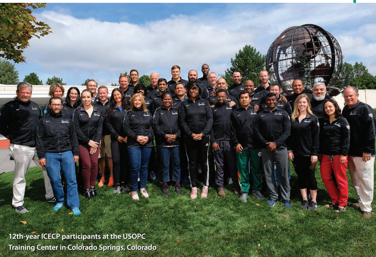
12th-year ICECP participants at the USOPC Training Center in Colorado Springs, Colorado

“This is a very high classed coaching course taking into consideration its content and intensity, great idea to keep, there should be a follow up of past participants after they pass through this program for an international network. There should be a physical exercise by all coaches as a group twice a week, a proper tour of the gym because some of us saw certain machines for the first time. Thanks for all the great work!”