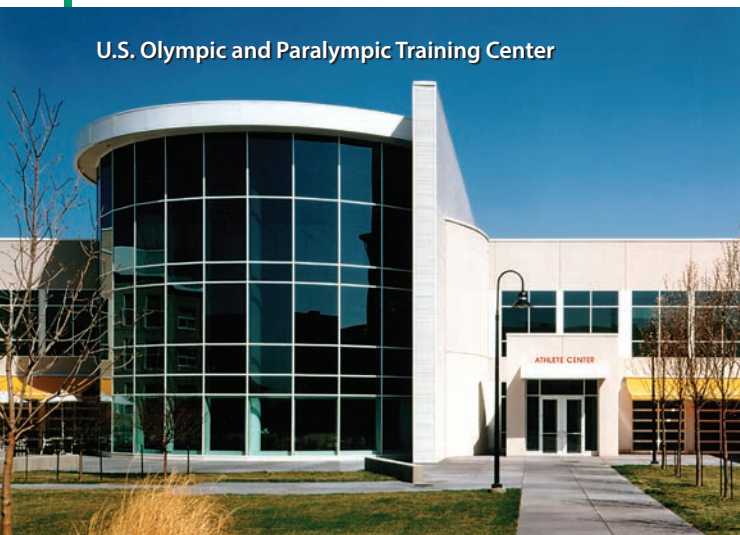
U.S. Olympic and Paralympic Training Center

ICECP program participants will be housed at the U.S. Olympic and Paralympic Training Center in Colorado Springs and gain an in-depth understanding of the workings of the USOPC's Olympic and Paralympic Training Center and athlete support programs through the performance services division. Additionally, the courses taught in Colorado Springs will be conducted by USOPC staff and experts.