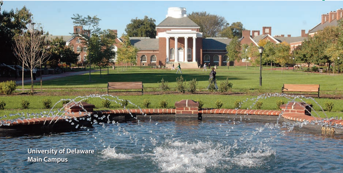
University of Delaware Main Campus

THE UNIVERSITY OF DELAWARE has grown from its founding as a small private academy in 1743 to a major university. The University offers an impressive collection of educational resources. The 16,000 undergraduate students may choose to major in any one or more of over 100 academic majors. The University's distinguished faculty includes internationally known scientists, authors and teachers, who are committed to continuing the University of Delaware's tradition in providing one of the highest quality undergraduate educations available in the United States.