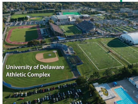
University of Delaware Athletic Complex

Visit www.udel.edu to learn more about the University.